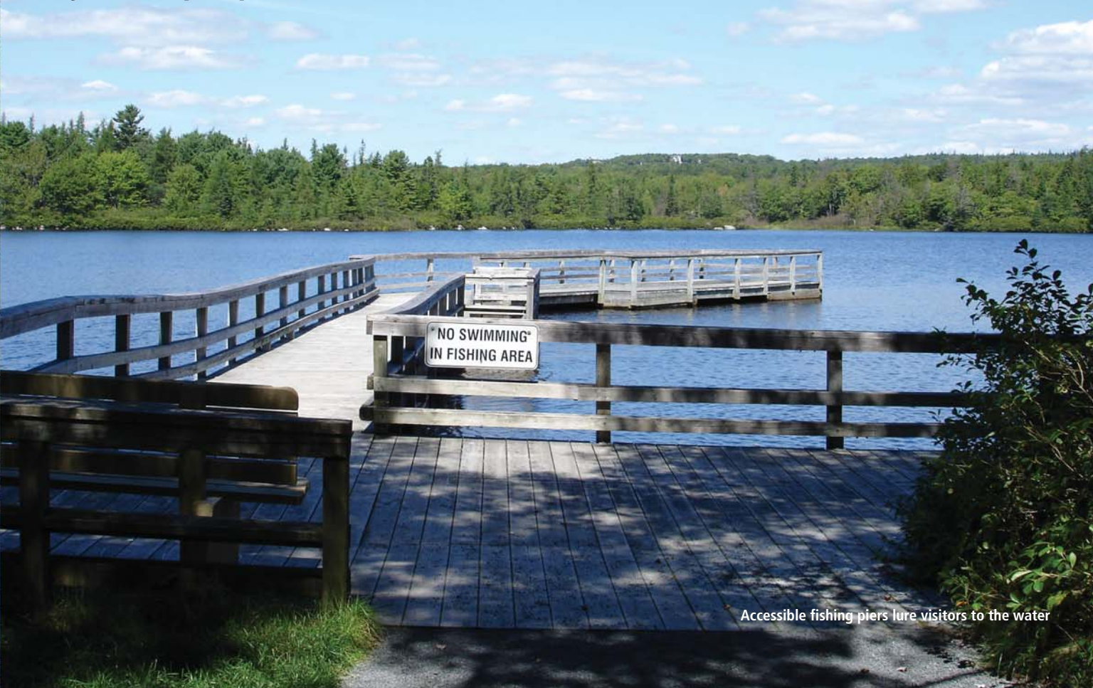
Accessible fishing piers lure visitors to the water

fishing piers hover on the tranquil lake, inviting visitors to leisurely enjoy hours of fishing in the autumn, spring and summer months. Bring a pair of binoculars with you and enjoy a comfortable stroll along one of the park's four accessible nature trails while looking for feathered inhabitants, plants and wild flowers. Please do not damage or remove them. Parking areas and drive-in picnic sites are conveniently located close to all facilities including a barrier-free vault toilet.