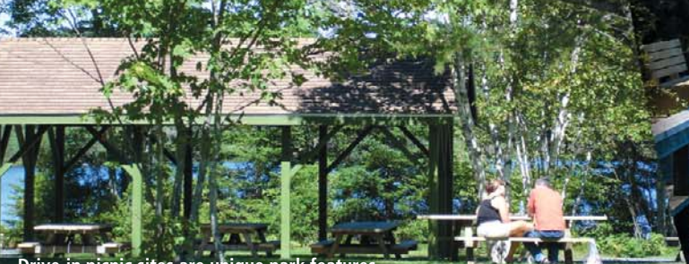
Drive-in picnic sites are unique park features